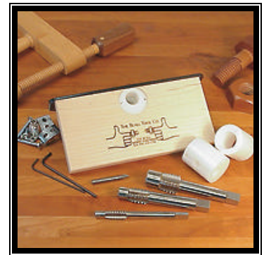
Beal Wood Threader kit

If you own one or know of anyone that owns one, Greg would like to talk to you and get some first hand feedback. ☺