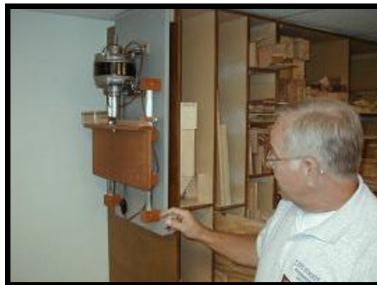
John Freeland's Shop