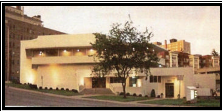
The Community Christian Church Corner of 46 th St. and Main, KC MO

We have an opportunity to have an escorted tour of the Frank Lloyd Wright's designed church at the corner of Main and 46 th Street (just across Main Street from Nichols fountain). The trip is